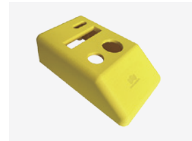
Electrical and electronics (E&E) industry