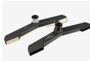
Jigs & Fixtures