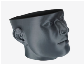
Art and sculpture