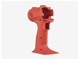
Prototyping and design