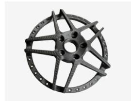
Tools and fitting